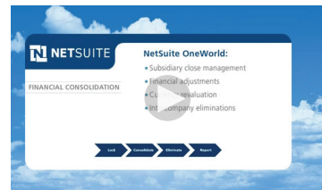
Introduction to NetSuite, Part 2