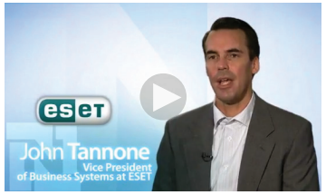
ESET achieves 10X growth with NetSuite.