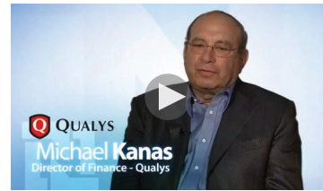
Qualys streamlines its CRM and ERP.