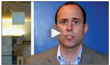
Eloqua manages a global software business.