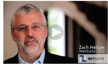
Cloud computing: The next—and last—great technology architecture.